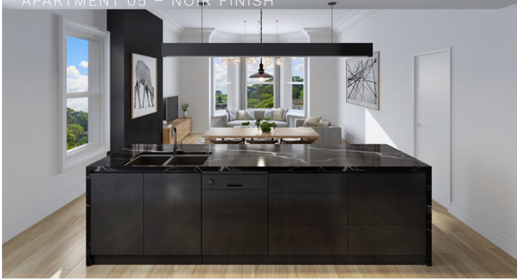
APARTMENT 05 – NOIR FINISH