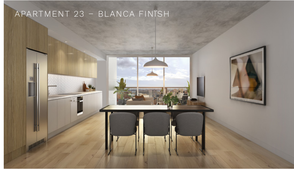
APARTMENT 23 – BLANCA FINISH