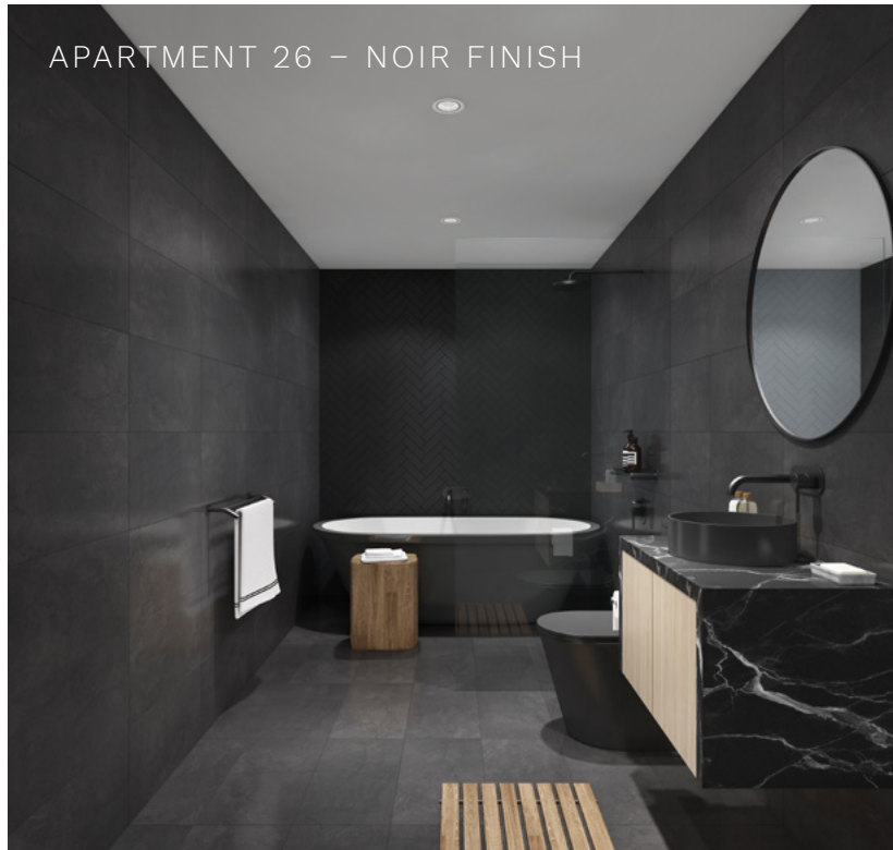
APARTMENT 26 – NOIR FINISH