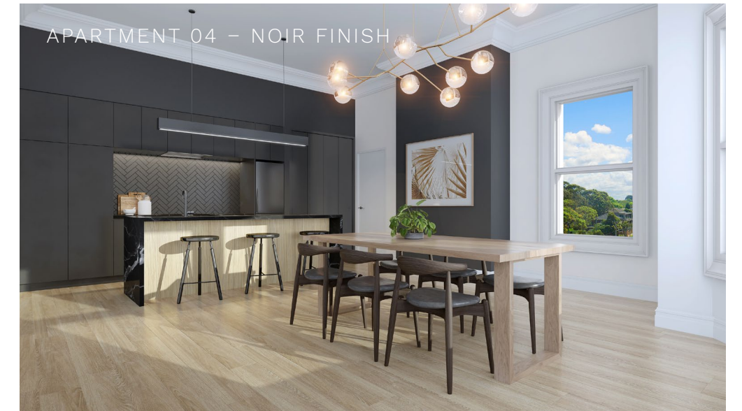
APARTMENT 04 – NOIR FINISH