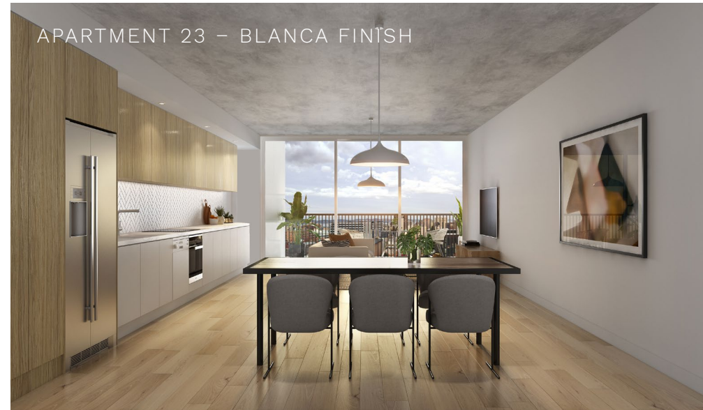
APARTMENT 23 – BLANCA FINISH