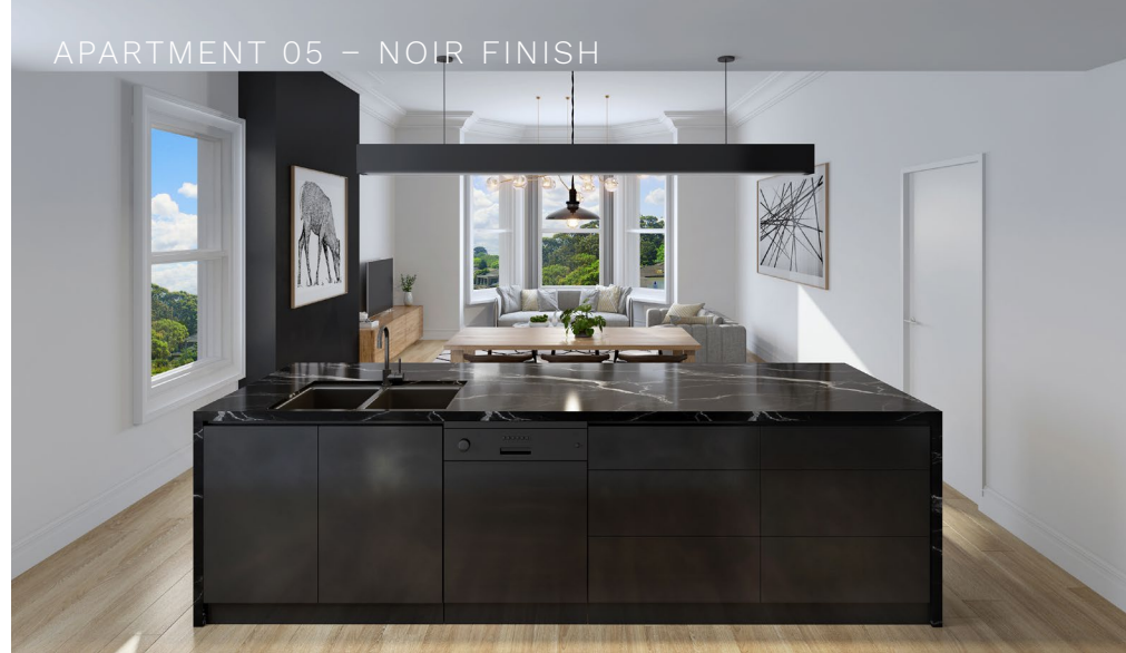
APARTMENT 05 – NOIR FINISH