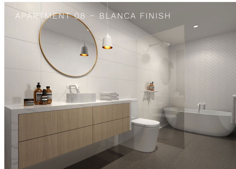
APARTMENT 08 – BLANCA FINISH